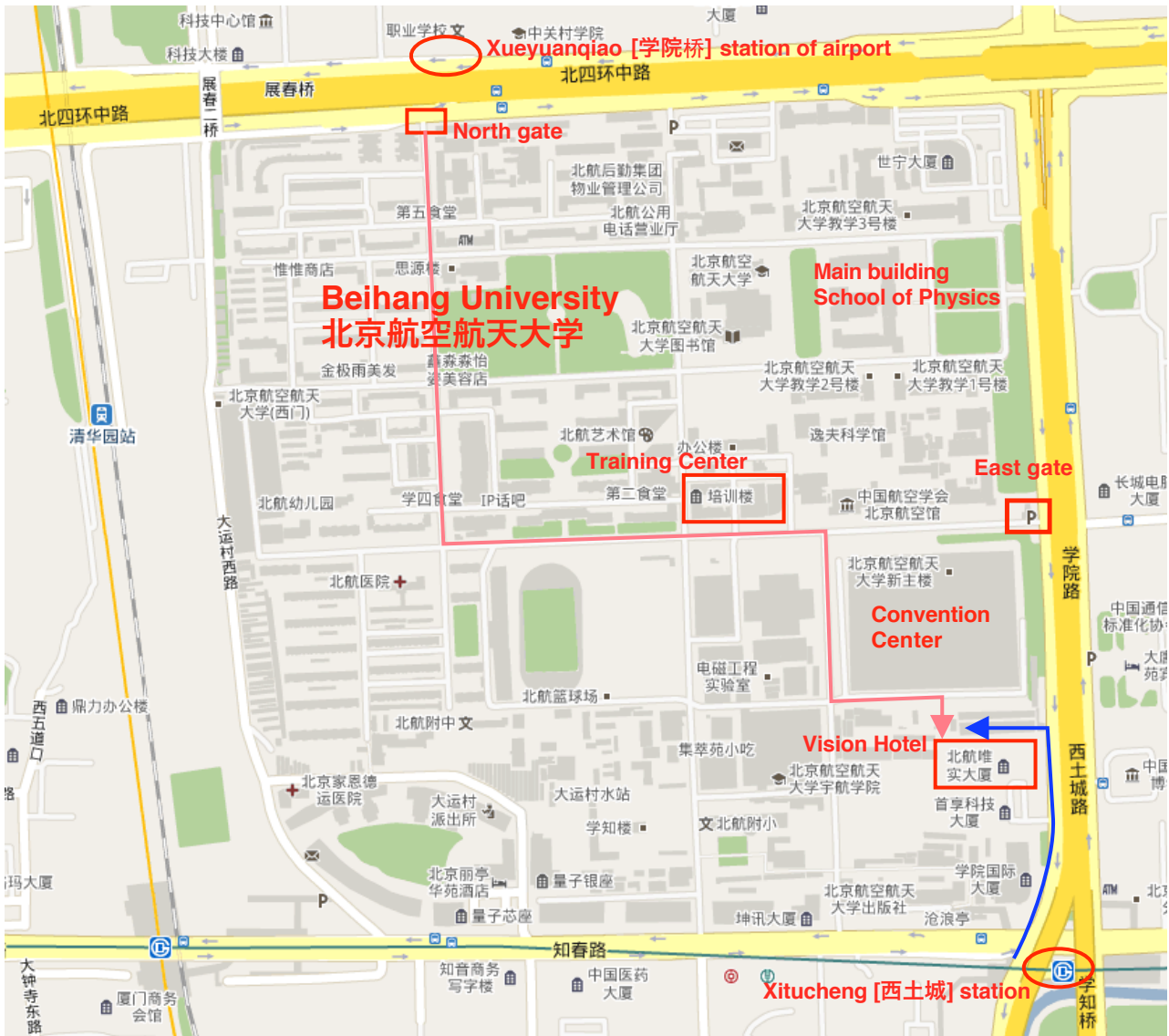
Map of the Beihang University

If you want to attend the symposium but not registered yet, then visit our web site and register yourself. http://indico.ihep.ac.cn/conferenceDisplay.py?confId=1714